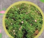
Nootka Rose Rosa nutkana