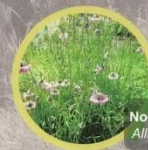
Nodding Onion Allium cernuum

The collection features many "water-wise" plants for home use. How many of those pictured can you find in the garden?