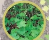
Fringe Cup Tellima grandiflora