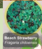
Beach Strawberry Fragaria chiloensis