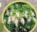
Oceanspray Holodiscus discolor