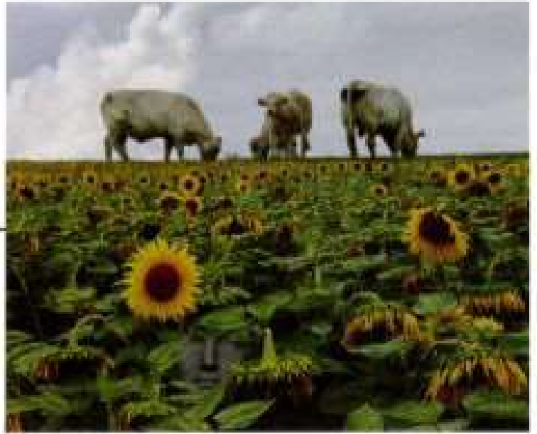
KENT VAN SLYKE